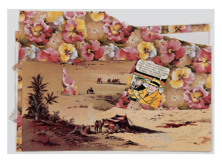
John Ashbery, "Desert Flowers" 2014, collage, 9.75 x 14 inches

movies, from the high to the shabby, a love of books of all kinds, alongside cartoons and memorabilia, and you get an idea of their shared passion for the ephemeral. In different ways, each of them has memorialized a fleeting moment, revitalized a forgotten or neglected possibility, and juxtaposed disparate fragments.