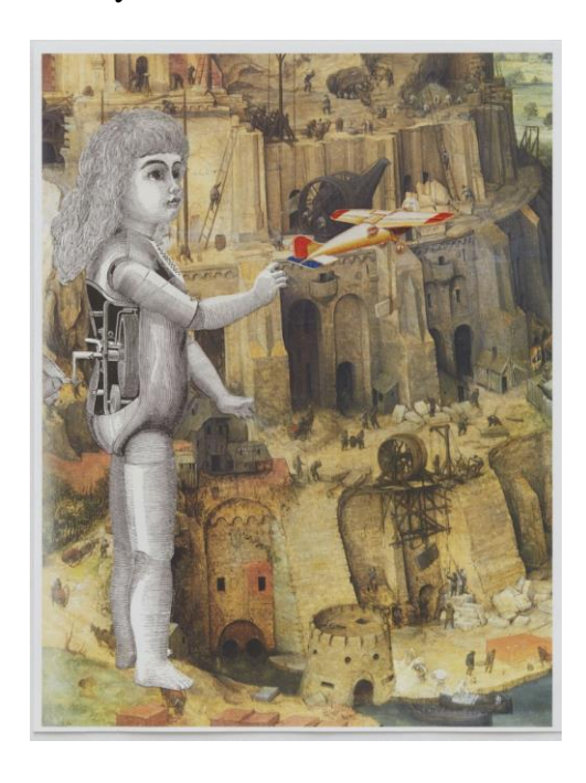
John Ashbery, "Wind Up Doll," 2017, collage

full of cars as in the two children in "Oh, What Fun!" (2016). Nothing bad has befallen them yet.