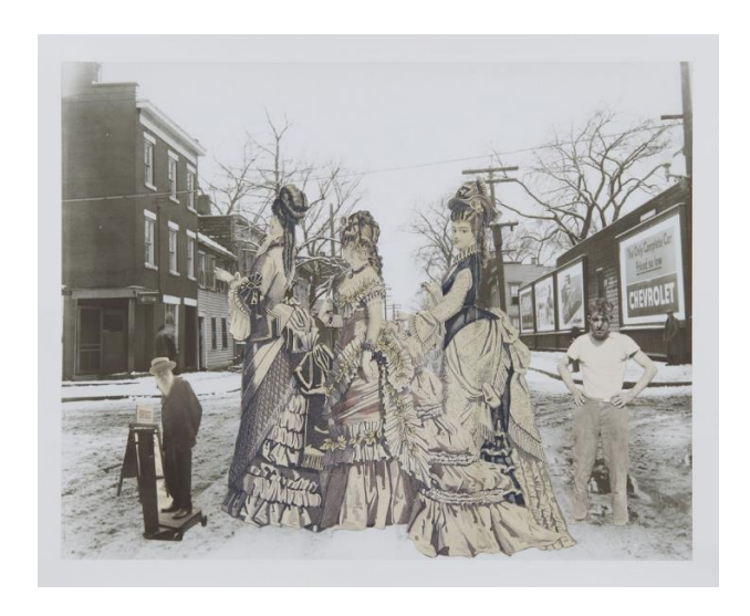
John Ashbery, "Three Victorian Women," 2017, collage

The collages that use game boards are like looking at a rebus that we will never be able to decipher. In "Promenade" (2011), Ashbery used a digitized print-out of a game-board, Rocket Dart-Words, which was sold in the mid-1950s. He superimposed images (including one with the words "Mend All" on it) onto a grid of letters, five to a row. None of the rows of letters seem to spell a word. Since some of the letters are partially obscured by the collage elements, it is impossible to tell if any of the rows add up to a word. Another visual element is a ring encircled by a cluster of bands with numbers on them. Are the numbers like those on a safe? What are we to unlock with our looking?