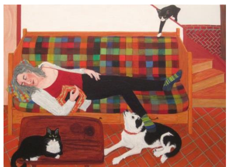
The artist has said of her work:

The gallery is pleased to present an exhibition of egg tempera and acrylic paintings completed over the last two years. The exhibition marks the artist's fifth with the gallery.