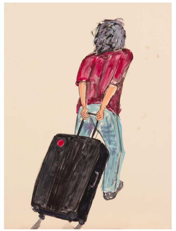
Sarah McEneaney Arrival Departure, 2023 acrylic on panel

Tibor de Nagy is pleased to present Sarah McEneaney The World Around: A Mixed Bag, a n exhibition of small panel paintings and works on paper. This is the gallery's first exhibition solely devoted to McEneaney's drawings and small-scale work.