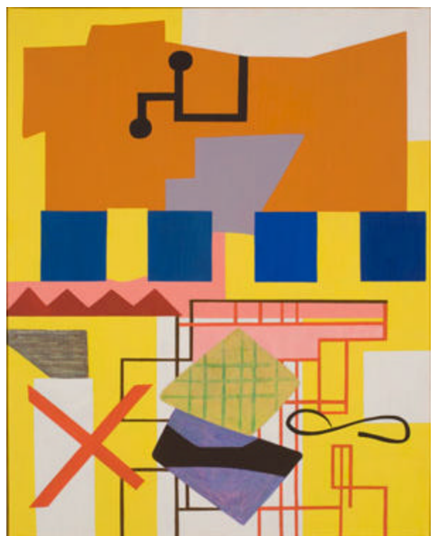
Shirley Jaffe, "Labyrinth" (2009-10). Oil on canvas, 32×25 1/2 inches. Courtesy of the artist and Tibor de Nagy Gallery.

Jaffe: It first happened as an accident, a way of introducing another surface without meticulously painting another kind of surface. It's practically mechanical, but it was interesting to me because it broke up that sameness that was developing in my paintings. And I liked the fact that I could introduce something else as a material surface.