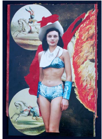
Guy Maddin, “Untitled (#29),” 2015, collage on bookcover, 13 1/8 x 9 inches