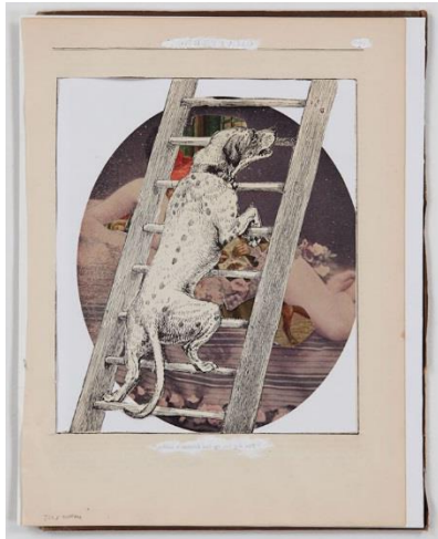
Guy Maddin, "Untitled (#07)" 2015, collage and whiteout on bookcover, 9.875 x 7.75 inches