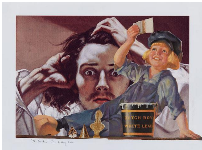
John Ashbery, The Painter , 2014, collage, 15 x 20.5 inches

I have known John Ashbery since 1975, which means that either I should excuse myself from writing a review of his collages — especially since I wrote about them in 2008, ( The Brooklyn Rail , October 2008) when he had his first exhibition at the age of eighty-one – or that I am in the position to know his work (the poems and collages) better than most people, and therefore have a duty to write about them. I will let the reader brood over that muddle, particularly since I don't think what follows even qualifies as a review, which implies a critical distance on the part of the writer.