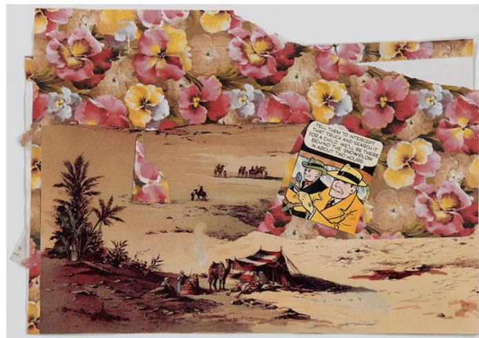
John Ashbery, "Desert Flowers" 2014, collage, 9.75 x 14 inches