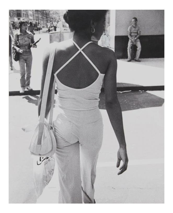
RUDY BURCKHARDT Shoulders , c. 1975

York Moments was presented at the Kunstmuseum Basel in 2005. He was also included in the recent group exhibition Slab City in 2019 at the Farnsworth Art Museum in Rockland, Maine.