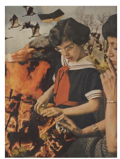
Untitled (Girl with Geese), 1955, collage, 13 ¾ x 9 ¾ inches